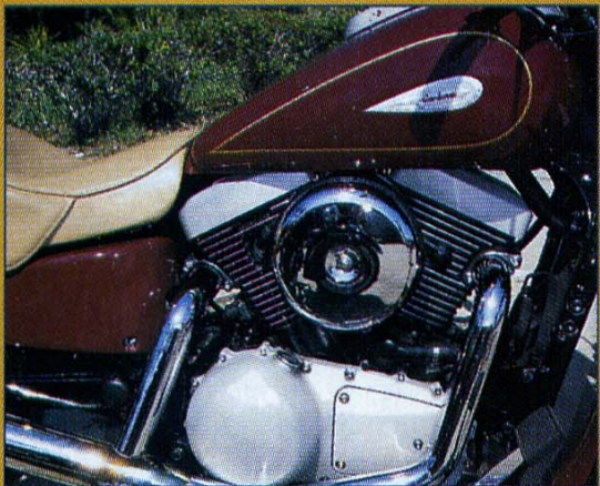
Indian flathead 74-ci pushrod, air-cooled, sidevalve, chain final drive. Kawasaki OHV 1500cc, liquid-cooled plant transfers power via driveshaft.