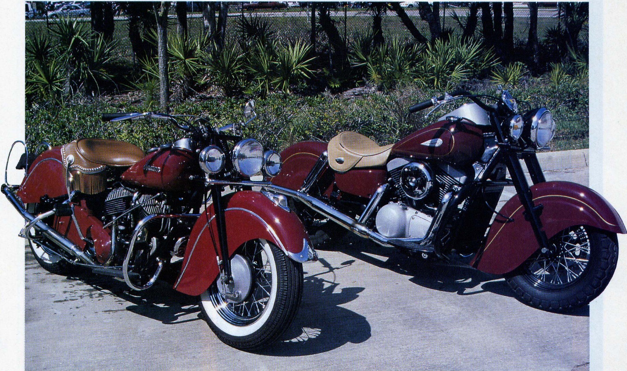
1946 Indian Chief (left) and 1996 Kawasaki Vulcan 1500 Classic (right). While they look a lot alike, don't be fooled by the clever disguise. There's a half century of technology separating them. The Indian is sporting new Coker whitewalls.