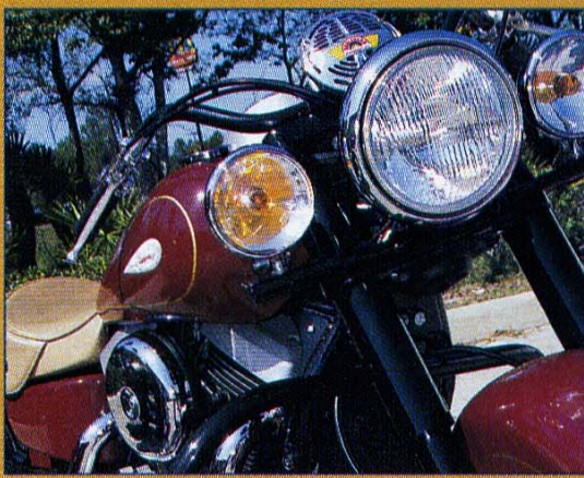
Indian has clean lines allowing plenty of air to cool the engine directly. The Kawasaki is liquid-cooled with a tidy and almost invisible radiator up front.